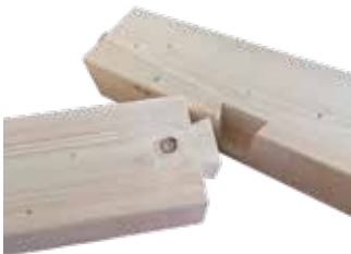
Dovetail joint with approval